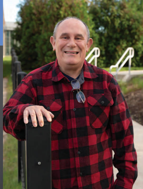
Kevin Garvey Printing & Publishing Services