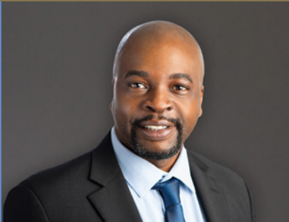
Michael Spears School of Management