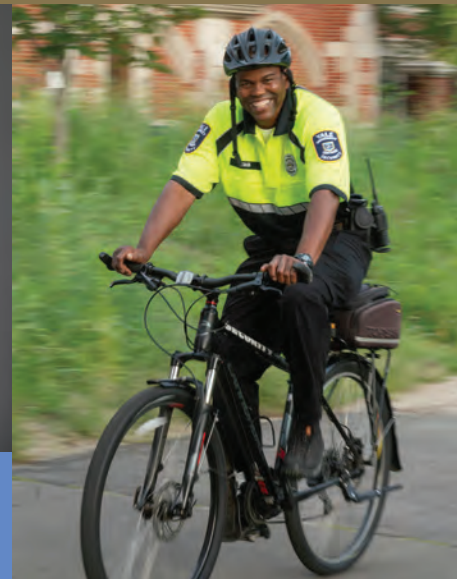
Robert Mack Security