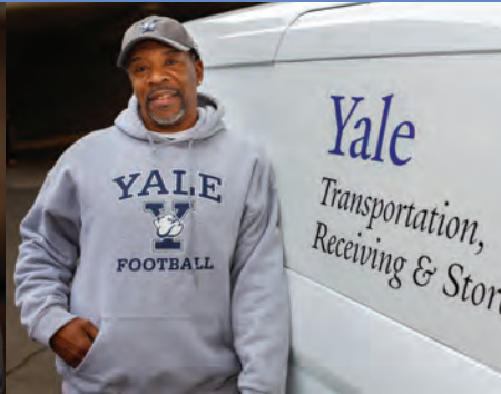
Bernie Ford Transport, Receiving, & Storage