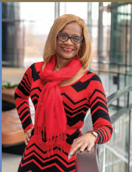
Mary Hall Facilities, Business Office