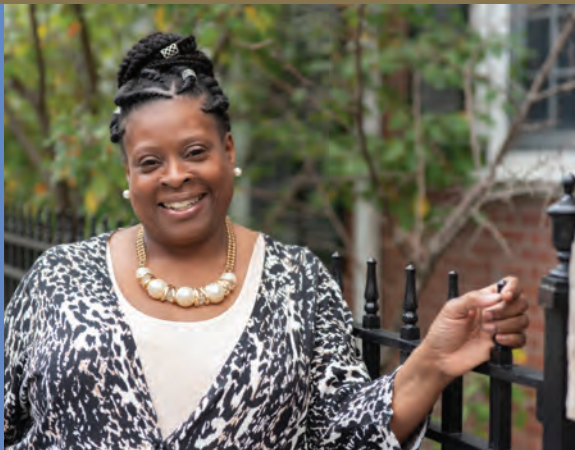
Nellie West Hospitality