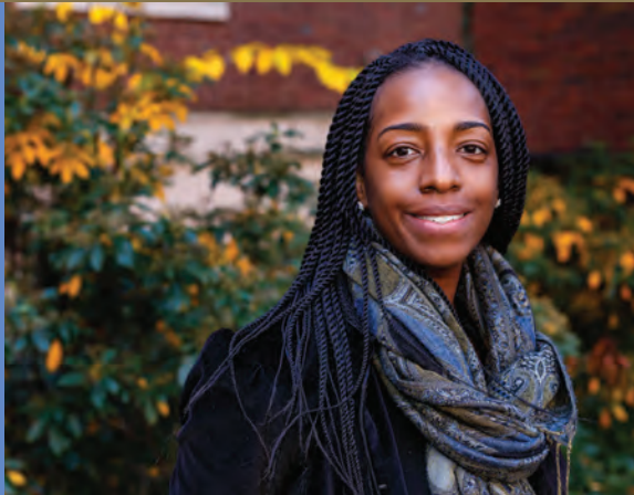
Tasha Brooks-Boone Child Study Center