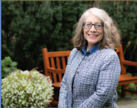
Judy Spak Medical Library