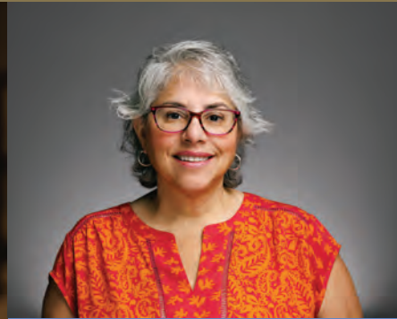
Tammy Stalmack Center for Clinical Investigation