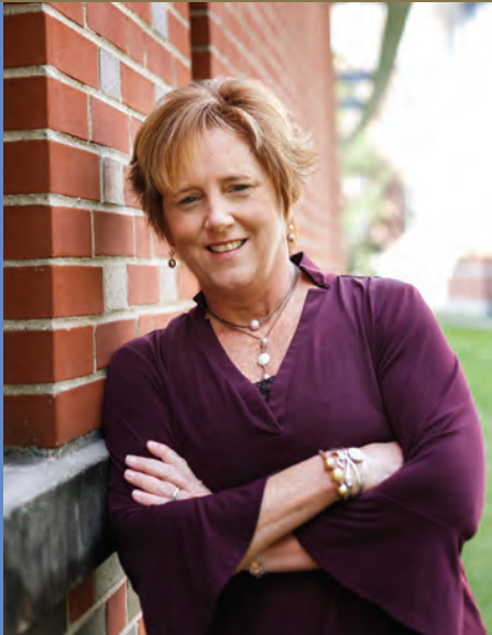
Kathleen Fisher School of Public Health