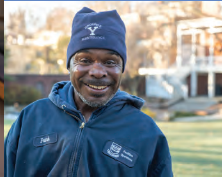
Frank Lowe Grounds Maintenance