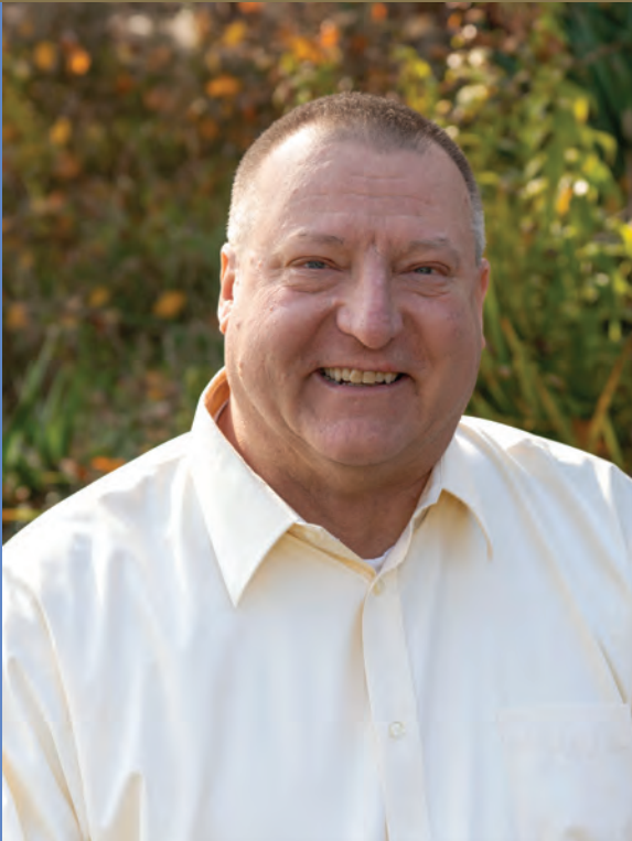
Paul Gluhosky Center for Research Computing