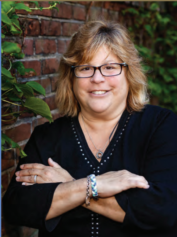
Francesca Sutton Animal Resources Center