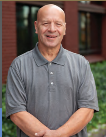
Peter Rodriguez School of Medicine, Stockroom