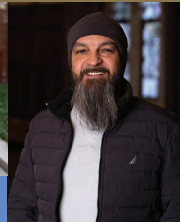
Juan Carlos Roman Animal Resources Center