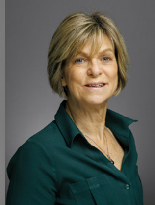
Joan O'Sullivan School of Public Health